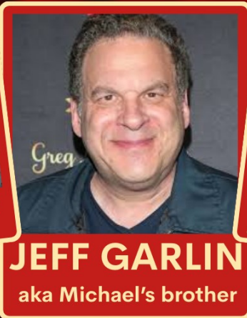
JEFF GARLIN aka Michael's brother